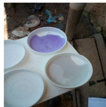
Figure 2. Reaction of milk with CMT reagent.