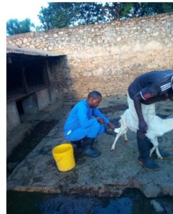
Figure 1. Collection of milk samples from the goat.

The milk samples collected screened for subclinical Mastitis using California Mastitis Test (Figure 1). The milk sample was mixed with equal volume of CMT reagent by swirling / circling motion. The results were taken as positive for those samples graded +2 and +3 while 0, Trace and +1 were regarded as negative as instructed in CMT manual (Figure 2). Table 2 is showing CMT somatic cell count estimate and the features of milk changes after mixing CMT reagent with few mills (5mls) of milk.